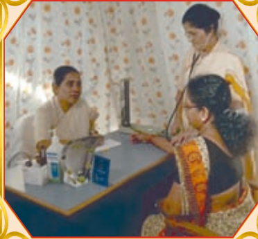
Rosa Mystica Ayurveda Clinic Gurpur, Kinnikambla