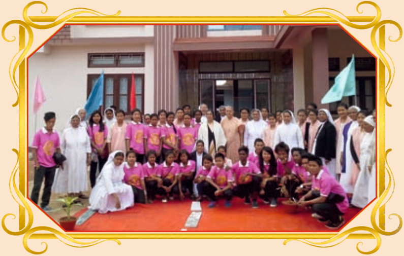
Bethany Institute of Resource Development Umsning, Meghalaya