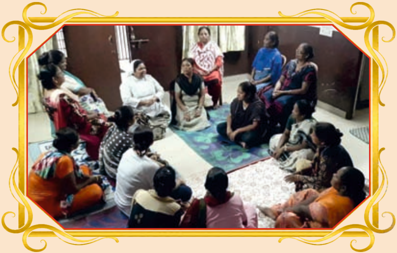
Karunalaya Centre for Women Karnal, Haryana