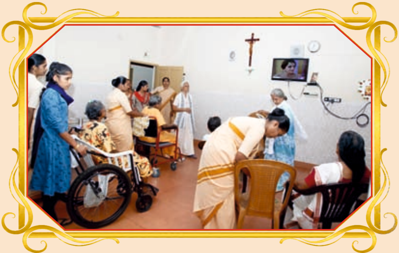
Bethany Santhwana Destitute Home Karakundu, Kannur Dist, Kerala