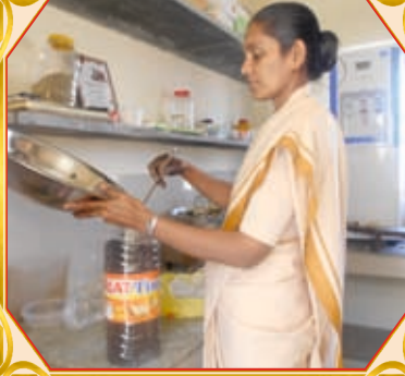
Karunamatha Holistic Centre Gadenahally, North Karnataka