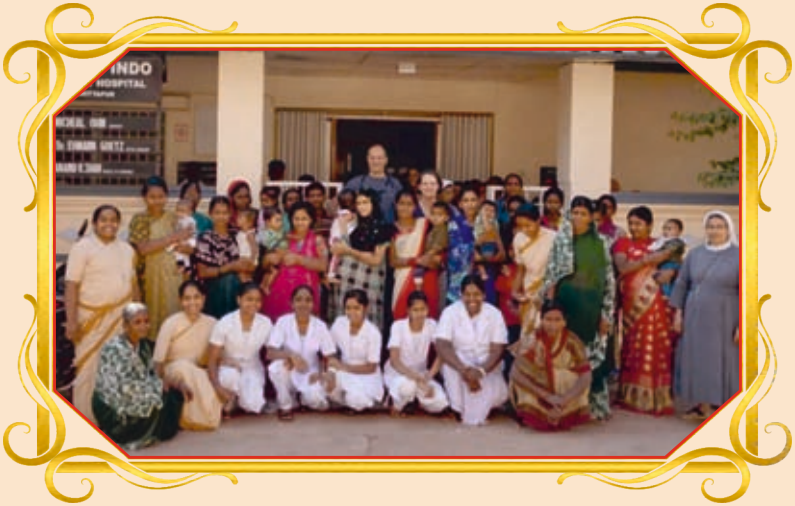
Dr OHM INDO German Hospital Extension Chittapur, North Karnataka