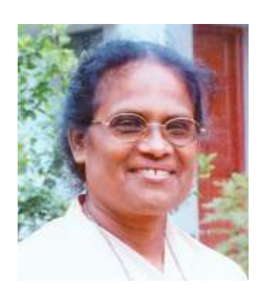
From the Editor

This issue of Bethany Connection comes to you in a new format. It does not carry the normal news of various communities. I am happy to present this special issue dedicated to Bethany Social Service Society, Punjab (BSSSP). Bethany Sisters have been involved in social work ever since Bethany Congregation was founded in 1921. Northern Province was formed in 1986. The umpteen social work of the Province was brought under the BSSSP(Reg) in 1993 marking 2018 as the Silver Jubilee Year.