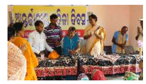
Shanti Ashram, Berhampur, Odisha