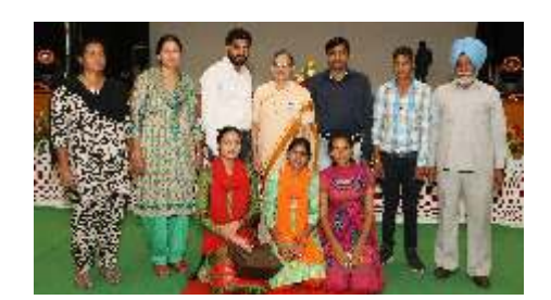
Jeevan Jyoti Vocational Training Centre, Ludhiana, Punjab

Jesus says, "Whatsoever you do to the least of my people,that you do unto me..."