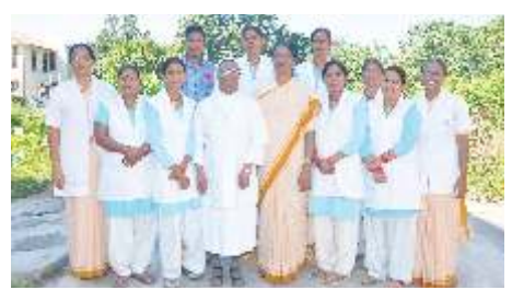
Bethany Jeevan Dhara Tanakpur, Uttarakhand