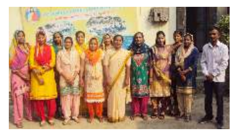
Regional Unit, Samalkha, Haryana